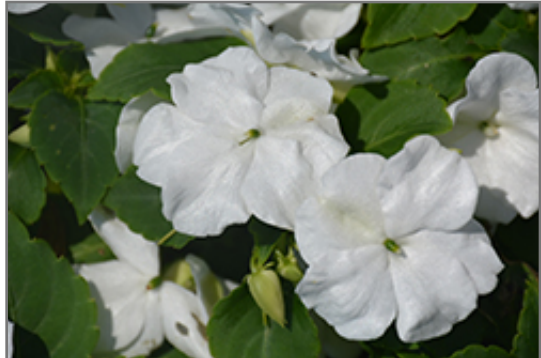
Accent Premium White Impatiens flowers

Accent Premium White Impatiens is recommended for the following landscape applications;