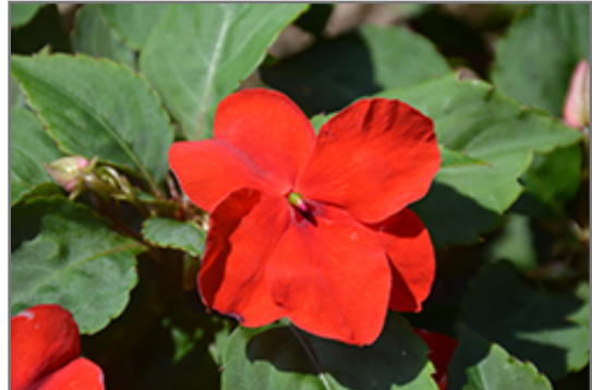
Accent Premium Red Impatiens flowers

Accent Premium Red Impatiens is recommended for the following landscape applications;