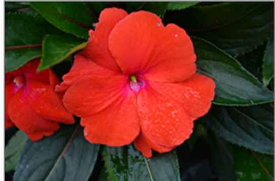
Magnum Red Flame New Guinea Impatiens flowers

Magnum Red Flame New Guinea Impatiens is recommended for the following landscape applications;