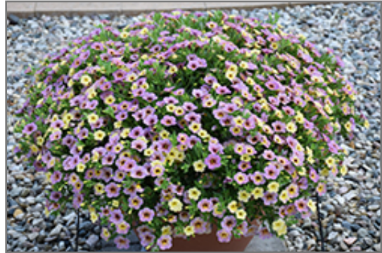
Chameleon Blueberry Scone Calibrachoa in bloom