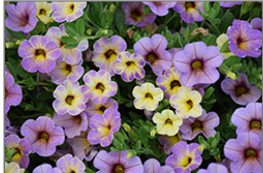
Chameleon Blueberry Scone Calibrachoa flowers

Chameleon Blueberry Scone Calibrachoa is a dense herbaceous annual with a trailing habit of growth, eventually spilling over the edges of hanging baskets and containers. Its medium texture blends into the garden, but can always be balanced by a couple of finer or coarser plants for an effective composition.