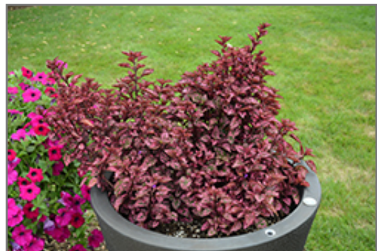
Hippo Rose Polka Dot Plant