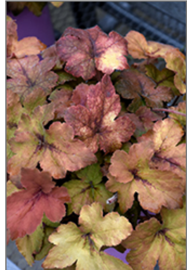
Pumpkin Spice Foamy Bells flowers

Pumpkin Spice Foamy Bells is recommended for the following landscape applications;