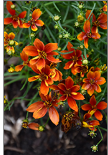
Sizzle And Spice Crazy Cayenne Tickseed flowers

Sizzle And Spice Crazy Cayenne Tickseed is recommended for the following landscape applications;