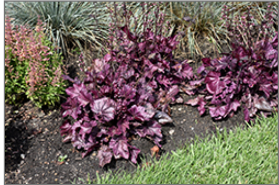
Wild Rose Coral Bells

This is a relatively low maintenance plant, and should be cut back in late fall in preparation for winter. It is a good choice for attracting hummingbirds to your yard. It has no significant negative characteristics.