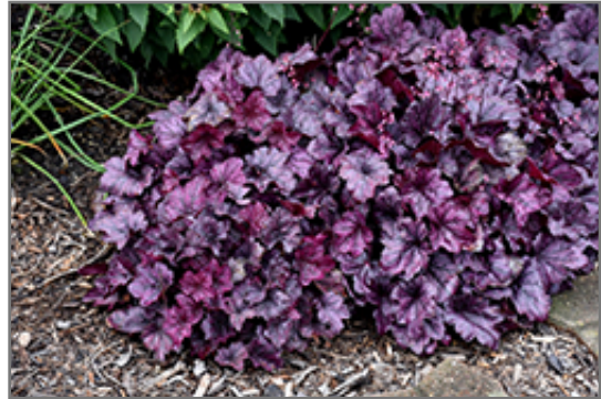
Wild Rose Coral Bells

Wild Rose Coral Bells is a dense herbaceous evergreen perennial with tall flower stalks held atop a low mound of foliage. Its relatively coarse texture can be used to stand it apart from other garden plants with finer foliage.