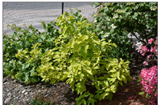
Neon Burst Dogwood