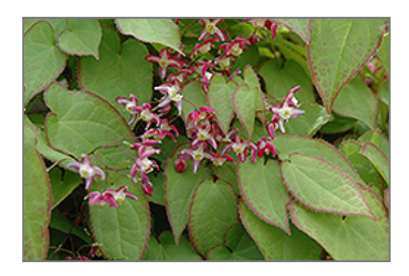
Bishop's Hat flowers

Bishop's Hat is a dense herbaceous evergreen perennial with a ground-hugging habit of growth. Its relatively fine texture sets it apart from other garden plants with less refined foliage.