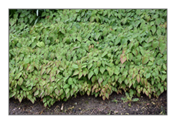
Bishop's Hat

Bishop's Hat will grow to be about 12 inches tall at maturity, with a spread of 18 inches. When grown in masses or used as a bedding plant, individual plants should be spaced approximately 15 inches apart. Its foliage tends to remain dense right to the ground, not requiring facer plants in front. It grows at a medium rate, and under ideal conditions can be expected to live for approximately 10 years. As an evegreen perennial, this plant will typically keep its form and foliage year-round.