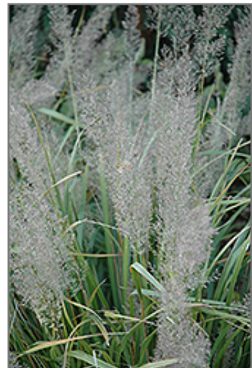
Korean Reed Grass fruit