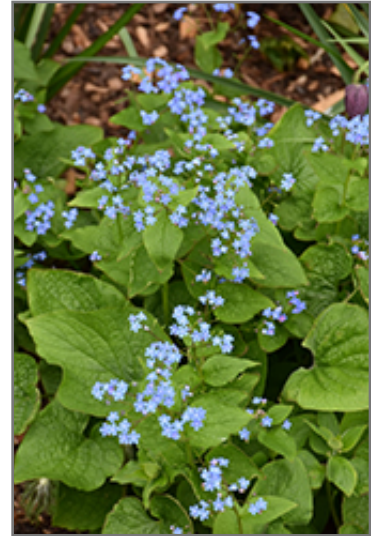
Siberian Bugloss flowers

Siberian Bugloss is recommended for the following landscape applications;