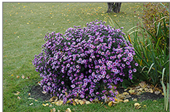
Purple Dome Aster in bloom