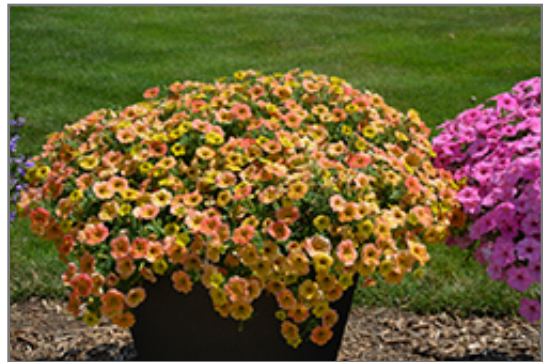
Supertunia Honey Petunia in bloom