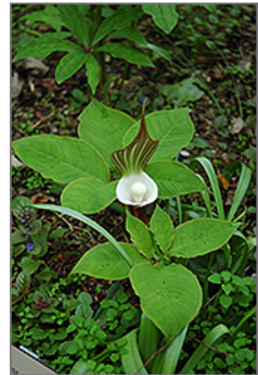
Japanese Jack-In-The-Pulpit in bloom