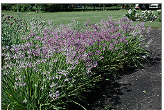
Nodding Onion in bloom

This is a relatively low maintenance plant, and should only be pruned after flowering to avoid removing any of the current season's flowers. It is a good choice for attracting butterflies to your yard, but is not particularly attractive to deer who tend to leave it alone in favor of tastier treats. It has no significant negative characteristics.