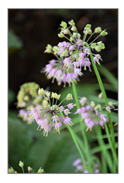
Nodding Onion flowers

This plant should only be grown in full sunlight. It does best in average to evenly moist conditions, but will not tolerate standing water. It is not particular as to soil type or pH, and is able to handle environmental salt. It is highly tolerant of urban pollution and will even thrive in inner city environments. This species is native to parts of North America. It can be propagated by multiplication of the underground bulbs.