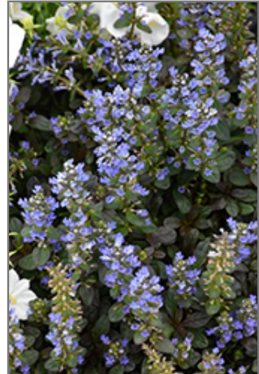
Chocolate Chip Bugleweed flowers

Chocolate Chip Bugleweed is recommended for the following landscape applications;