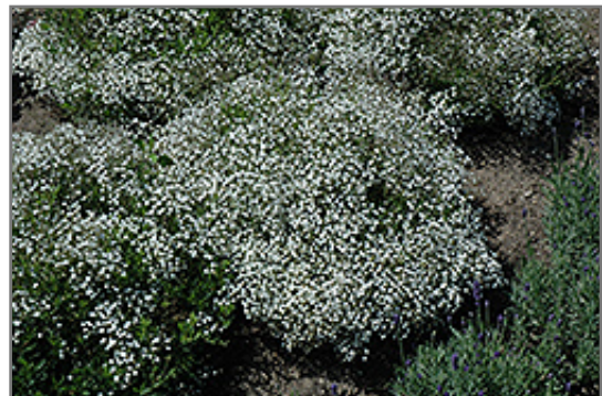
Summer Sparkles Baby's Breath in bloom