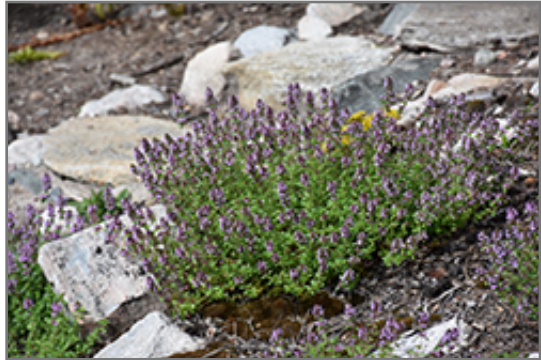
Lemon Thyme in bloom

This plant is quite ornamental as well as edible, and is as much at home in a landscape or flower garden as it is in a designated herb garden. It should only be grown in full sunlight. It prefers to grow in average to dry locations, and dislikes excessive moisture. It is considered to be drought-tolerant, and thus makes an ideal choice for a low-water garden or xeriscape application. It is not particular as to soil type or pH. It is highly tolerant of urban pollution and will even thrive in inner city environments. Consider covering it with a thick layer of mulch in winter to protect it in exposed locations or colder microclimates. This particular variety is an interspecific hybrid. It can be propagated by division; however, as a cultivated variety, be aware that it may be subject to certain restrictions or prohibitions on propagation.