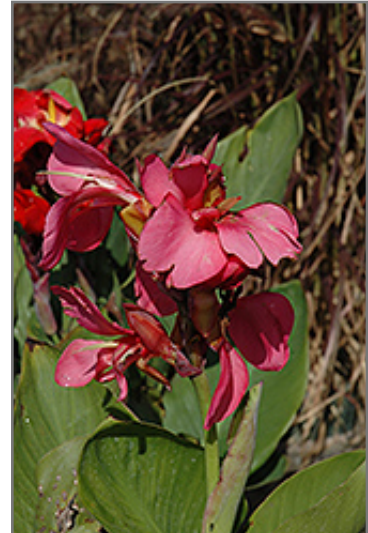
Tropical Rose Canna flowers

This plant should only be grown in full sunlight. It requires an evenly moist well-drained soil for optimal growth, but will die in standing water. It is not particular as to soil pH, but grows best in rich soils. It is highly tolerant of urban pollution and will even thrive in inner city environments, and will benefit from being planted in a relatively sheltered location. Consider applying a thick mulch around the root zone in winter to protect it in exposed locations or colder microclimates. This particular variety is an interspecific hybrid. It can be propagated by division; however, as a cultivated variety, be aware that it may be subject to certain restrictions or prohibitions on propagation.