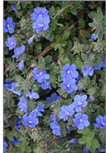
Blue My Mind Morning Glory flowers

Blue My Mind Morning Glory is recommended for the following landscape applications;