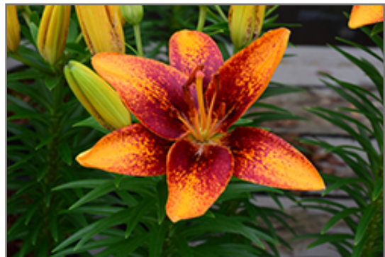
Lily Looks Tiny Orange Sensation Lily flowers