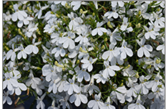
Techno Upright White Lobelia flowers

Techno Upright White Lobelia is recommended for the following landscape applications;