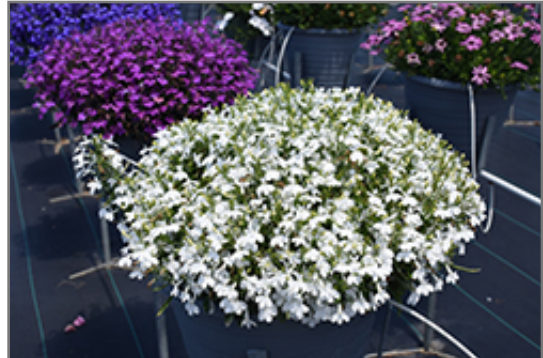
Techno Upright White Lobelia in bloom

Techno Upright White Lobelia is a fine choice for the garden, but it is also a good selection for planting in hanging baskets. Because of its trailing habit of growth, it is ideally suited for use as a 'spiller' in the 'spiller-thriller-filler' container combination; plant it near the edges where it can spill gracefully over the pot. Note that when growing plants in outdoor containers and baskets, they may require more frequent waterings than they would in the yard or garden.