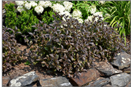
Tango Weigela

Tango Weigela makes a fine choice for the outdoor landscape, but it is also well-suited for use in outdoor pots and containers. With its upright habit of growth, it is best suited for use as a 'thriller' in the 'spiller-thriller-filler' container combination; plant it near the center of the pot, surrounded by smaller plants and those that spill over the edges. It is even sizeable enough that it can be grown alone in a suitable container. Note that when grown in a container, it may not perform exactly as indicated on the tag - this is to be expected. Also note that when growing plants in outdoor containers and baskets, they may require more frequent waterings than they would in the yard or garden. Be aware that in our climate, most plants cannot be expected to survive the winter if left in containers outdoors, and this plant is no exception. Contact our experts for more information on how to protect it over the winter months.