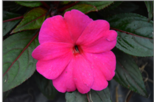
Magnum Blue New Guinea Impatiens flowers

Magnum Blue New Guinea Impatiens is recommended for the following landscape applications;