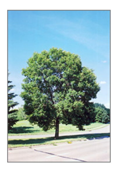
Green Ash