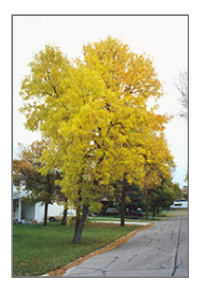
Green Ash in fall