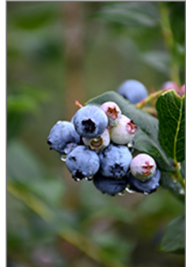
Chippewa Blueberry fruit

Chippewa Blueberry features dainty clusters of white bell-shaped flowers with shell pink overtones hanging below the branches in mid spring. It has green foliage throughout the season. The glossy oval leaves turn an outstanding orange in the fall. It features an abundance of magnificent blue berries in mid summer.