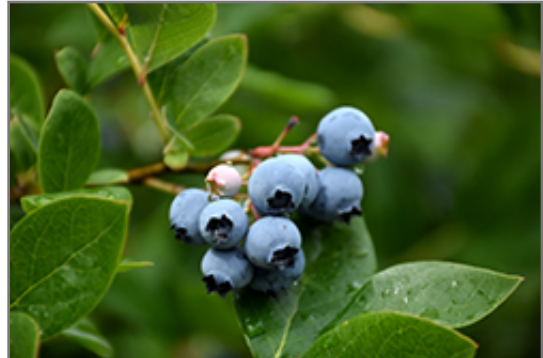
Northcountry Blueberry fruit

Northcountry Blueberry features dainty clusters of white bell-shaped flowers with shell pink overtones hanging below the branches in mid spring. It has green deciduous foliage. The glossy oval leaves turn an outstanding scarlet in the fall. It features an abundance of magnificent blue berries in mid summer.