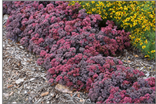
Dazzleberry Stonecrop in bloom