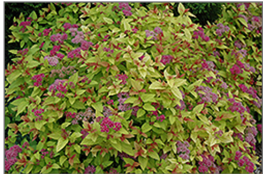
Magic Carpet Spirea flowers