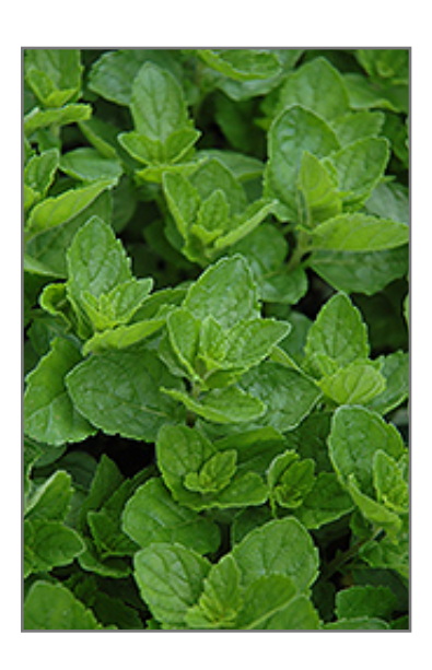
Spearmint foliage

This is an herbaceous perennial herb with a spreading, ground-hugging habit of growth. Its medium texture blends into the garden, but can always be balanced by a couple of finer or coarser plants for an effective composition. This is a high maintenance plant that will require regular care and upkeep, and should be cut back in late fall in preparation for winter. It is a good choice for attracting bees and butterflies to your yard, but is not particularly attractive to deer who tend to leave it alone in favor of tastier treats. Gardeners should be aware of the following characteristic(s) that may warrant special consideration: