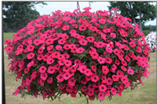
Supertunia Vista Fuchsia Petunia in bloom