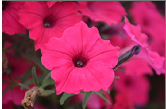
Supertunia Vista Fuchsia Petunia flowers

Supertunia Vista Fuchsia Petunia is recommended for the following landscape applications;