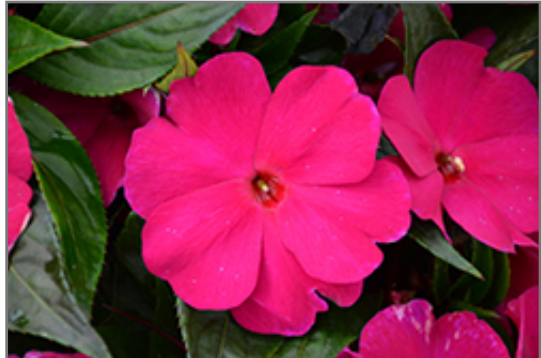
Magnum Purple New Guinea Impatiens flowers

Magnum Purple New Guinea Impatiens is recommended for the following landscape applications;