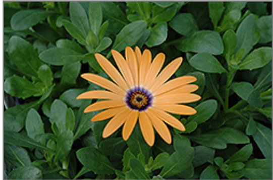
Orange Symphony African Daisy flowers