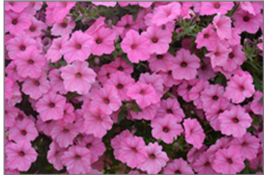
Supertunia Vista Bubblegum Petunia flowers

Supertunia Vista Bubblegum Petunia is recommended for the following landscape applications;