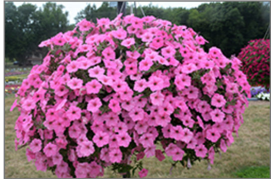
Supertunia Vista Bubblegum Petunia in bloom

Supertunia Vista Bubblegum Petunia will grow to be about 18 inches tall at maturity, with a spread of 24 inches. When grown in masses or used as a bedding plant, individual plants should be spaced approximately 20 inches apart. Its foliage tends to remain dense right to the ground, not requiring facer plants in front. This fast-growing annual will normally live for one full growing season, needing replacement the following year.