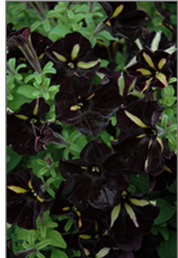
Phantom Petunia flowers