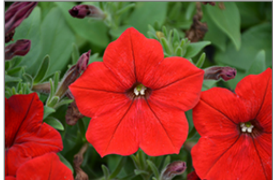
Easy Wave Red Petunia flowers

Easy Wave Red Petunia is a dense herbaceous annual with a trailing habit of growth, eventually spilling over the edges of hanging baskets and containers. Its medium texture blends into the garden, but can always be balanced by a couple of finer or coarser plants for an effective composition.