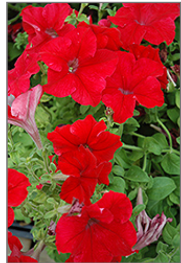
Dreams Red Petunia flowers