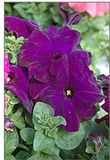
Dreams Midnight Petunia flowers