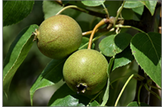
Golden Spice Pear fruit