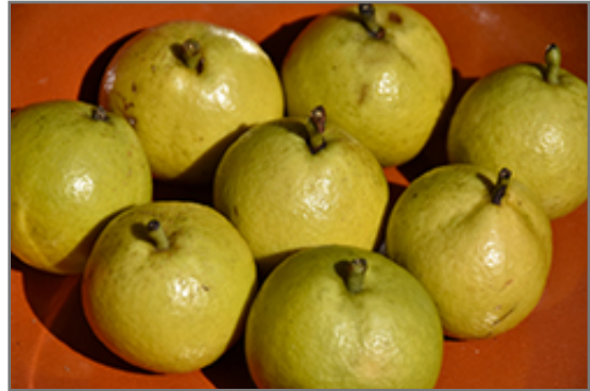
Golden Spice Pear fruit