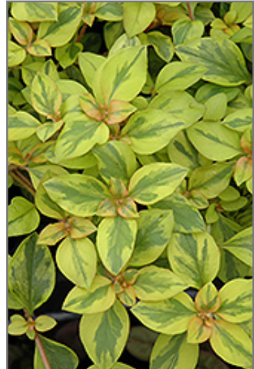
Walkabout Sunset Loosestrife foliage

Walkabout Sunset Loosestrife is recommended for the following landscape applications;