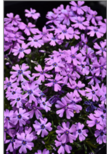
Purple Beauty Moss Phlox flowers