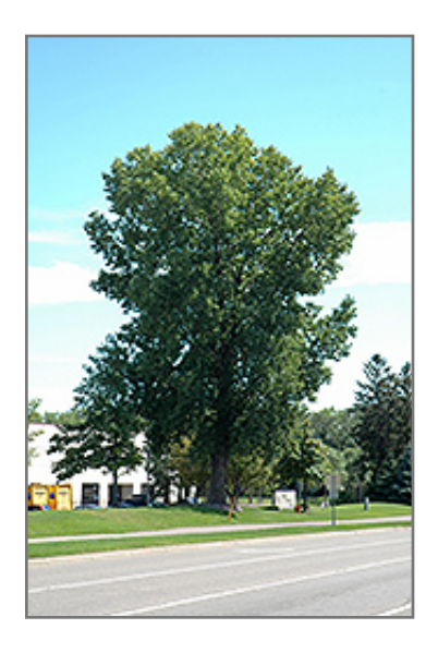
Siouxland Poplar