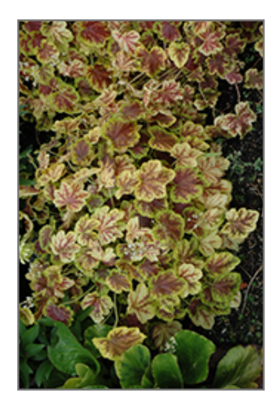
Solar Eclipse Foamy Bells