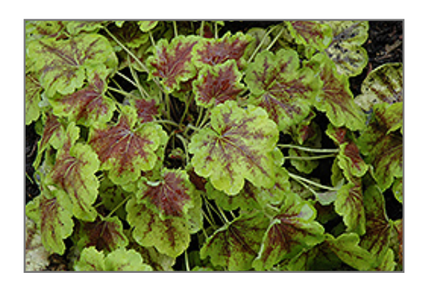
Solar Eclipse Foamy Bells foliage

Solar Eclipse Foamy Bells is recommended for the following landscape applications;