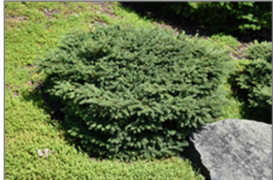
Birds Nest Spruce