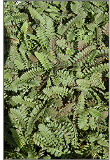
Brass Buttons foliage

This variety produces tiny fern like gray-green foliage; delicate fern-like leaves will tolerate some foot traffic; neither flowers or fruit are particularly ornamental; great as a color accent in a rock garden