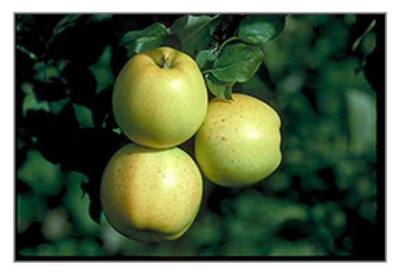
Honeygold Apple fruit

Honeygold Apple is a small tree that is commonly grown for its edible qualities. It produces large yellow round apples (which are botanically known as 'pomes') with hints of red and white flesh which are usually ready for picking from mid to late fall. The apples have a sweet taste and a crisp texture.